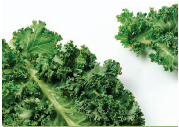
This is a fresh kale leaf.