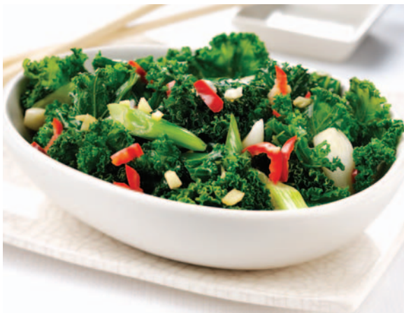
Cooked kale with red chillies

We cook kale before eating it. Sometimes it is boiled . Sometimes it is stir-fried .