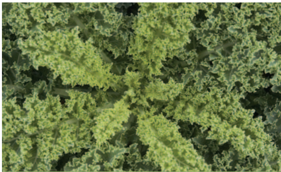
This is a fresh kale leaf.